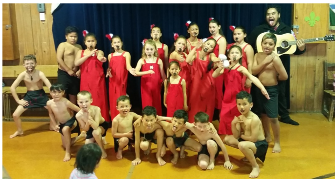
PIOPIO PRIMARY SCHOOL KAPA HAKA PERFORMANCE GROUP

In line with KEEP NEW ZEALAND BEAUTIFUL - CLEAN UP WEEK , junior students helped clean up around the school, Room 6 and 7 went down to Kara Park and filled up many trash bags along the way and at the park.